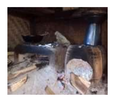
Figure 4. Form hawu as a stove Panuganti stove

The cooking culture in the Baduy kitchen is to use a stove instead of a stove, the stove used is made of clay, then the stove is placed on top of the paroko, in making paroko there are several things that must be prepared among them, plumbing banana frond leaves, seel leaves, carawuk leaves which are used as a base that limits the kitchen floor with paroko, after that sprinkled with earth and ash, This aims to prevent the fire during cooking from hitting the floor which can cause a fire. Furthermore, mantras will be read by traditional figures. In making paroko is given a minimum distance of an inch between the floor and the paroko.