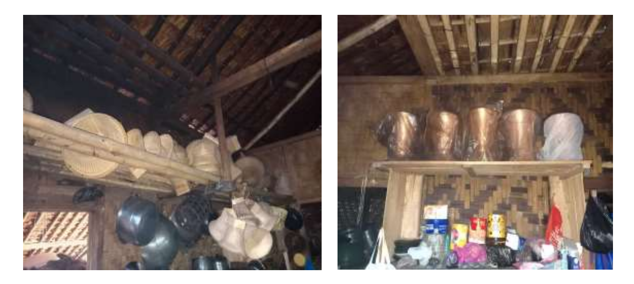
Figure 6. Kitchen equipment Baduy Luar

Goods and kitchen utensils owned by the Baduy community are obtained in two ways, the first is by buying them from craftsmen. Equipment purchased such as those made of copper such as seeng, equipment made of stainless steel namely kekenceng, kelaci, pan, equipment made of clay for example furnaces, haseupan, barrels, coet, paso . Equipment made of woven bamboo is baboko, dulang, hihid, kalo, nyiru . Tools made of wood such as cutting boards, knives, machetes, siuk, centong, graters. Equipment made of glass such as jembling bottles, glass cups, the second way is obtained by making your own equipment made of bamboo such as bamboo glasses, lodong. coconut shell dipper.