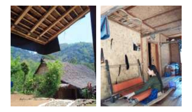
Figure 1. The roof of the outer Baduy house (left); wall and floor of Baduy house outside (right) on Baduy Luar

wood and the floor of the house uses boards. The kitchen in Baduy's house is made of bamboo. In the part that will be occupied by the parako first sprinkled with soil to limit the floor so as not to be exposed to fire, then given a wooden partition. This is done so that when the fire burns, it does not strike the bamboo floor, which can cause a fire in the house building.