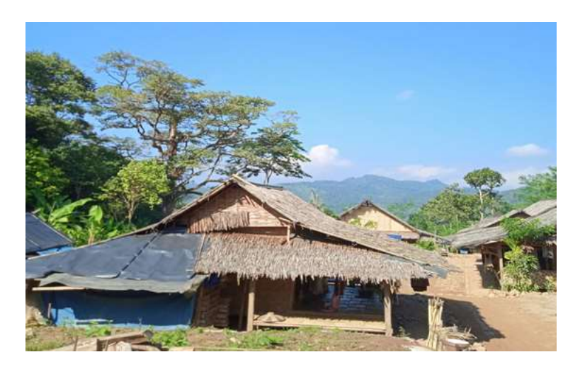
Figure 2. The Appearance of the house in the form of Baduy Luar

There are three rooms in the outer Baduy traditional house. (1.) Pendeng serves as a head out bed. (2.) Sosoro, serves as a reception.(3.) Fittings, functioning children's bedrooms and dining rooms for guests, gathering rooms with close relatives. Then another part of the outer Baduy house (1.) Golodog, i.e. the front porch of the house (2.) Paroko, a place to cook (3.) Goah, a warehouse for storing goods.