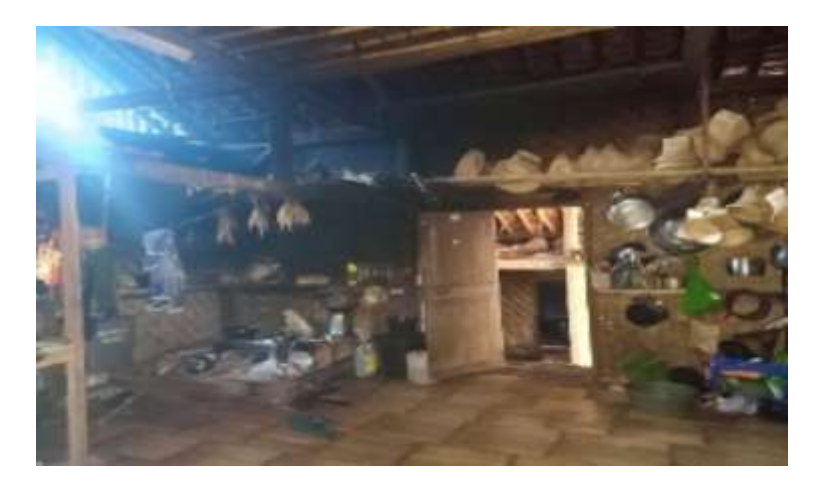
Figure 3. Papara in the kitchen that serves as a place to store the harvest and the appearance of the kitchen in Baduy Luar

In a house that only uses one paroko consists of pendeng, middle imah, tepas, golodog and front porch. While a house with two molos has a side door. The Baduy community still maintains local wisdom in the form of the use of hawu and paroko in the house. Inside the