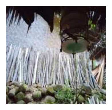
Figure 5. Firewood is stored next to the house, in houses in Baduy Luar

Goods and kitchen utensils owned by the Baduy community are obtained in two ways, the first is by buying them from craftsmen. Equipment purchased such as those made of copper such as seeng, equipment made of stainless steel namely kekenceng, kelaci, pan, equipment made of clay for example furnaces, haseupan, barrels, coet, paso . Equipment made of woven bamboo is baboko, dulang, hihid, kalo, nyiru . Tools made of wood such as cutting boards, knives, machetes, siuk, centong, graters. Equipment made of glass such as jembling bottles, glass cups, the second way is obtained by making your own equipment made of bamboo such as bamboo glasses, lodong. coconut shell dipper.