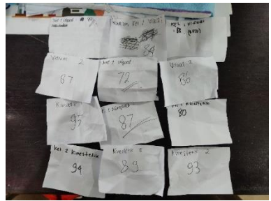
Figure 3. Group assessment results

Reflection stage, namely at the end of the lesson students are asked to fill out a Google form. Questions on the Google form contain descriptions of the groups they have worked with, responses to the products they have worked on, difficulties in the project work stage, and benefits obtained during the project work process. Based on students' responses, the difficulties they faced included collaboration between friends which was sometimes difficult and difficulties when creating three-dimensional models for groups with a kinesthetic learning style. The benefits that students get from differentiated learning with this project-based learning model are training cooperation between friends in groups, apart from that, students become more understanding about various atomic