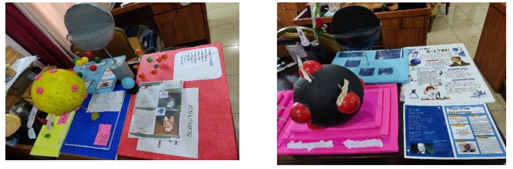
Figure 2. Differentiated learning products based on differences in learning styles

The differentiated learning carried out is integrated with a project-based learning model. Project-based learning takes into account a variety of student learning styles. Students can choose how to learn and practice the learning they do in the final product they create (Bell, 2010). There are three stages in project-based learning, namely planning, testing, and reflection. At the planning stage there is a problem solving stage that will be resolved, the testing stage is the process of working on the project until the product is produced, and the final stage is reflection and evaluation (Hawari, Ahmad & Noor, Azlin, 2020). The planning stage carried out in the learning process is that students search for information related to the atomic model theory that they have obtained, then design products that will be made based on differences in learning styles. At this stage, students in groups write their product designs on the worksheets that have been distributed. The testing stage is the stage when students create a previously designed product and then present it. Students are given one week to design their group's product based on differences in learning styles. After completing the presentation, other friends give an assessment to the group that has made the presentation.