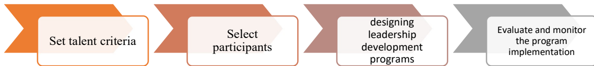
Figure 1 Stages talent pool program

The talent pool program at UT started in 2019, starting with conducting a leadership needs study, and reviewing talent pool concepts and policies. The four stages used as an approach to developing the talent pool program used are in the image below: