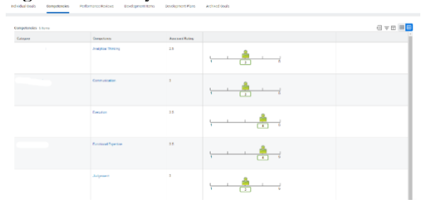
Figure 6. Workday Assessment