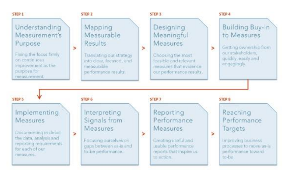
Figure 1. Training: Performance measurement is a process, docs employee HRM