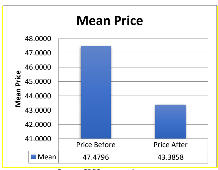
Figure 2. Mean results for the prices variable

Based on the table above, it can be seen that using 24 data shows that the data used on price and volume variables, namely before and after the G20 agenda was held in Bali, is valid, shown by a percentage value of 100% so that no data is lost when analyzing.