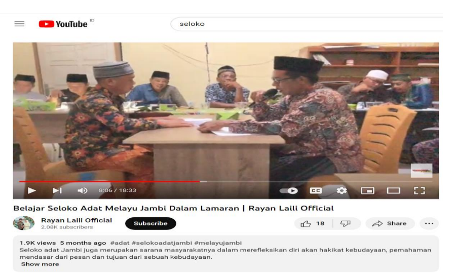
Youtube Recording Video Learning Jambi Malay Traditional Seloko in Application

Some digital documentation can be found in videos on youtube, this youtube content documents full activities on Jambi traditional Seloko ranging from academic discussions, marriage activities and proposals to be published in several official government-owned media. This is so that it can be seen visually and also audio of Jambi traditional Seloko activities as a whole and comprehensively.