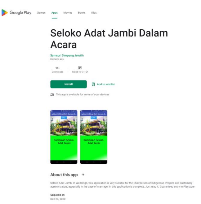
Jambi Traditional Seloko Application in Events available on Google Playstore

application contains a variety of Jambi traditional Seloko ranging from writing, procedures, information and also its implementation.