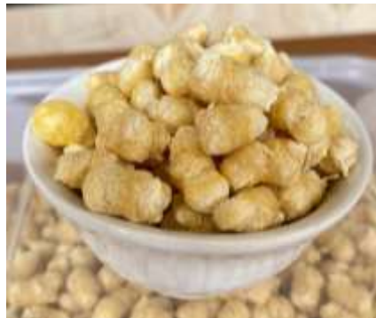
Figure 2. Snack extrudate combination of corn flour, shrimp skin and milkfish bones