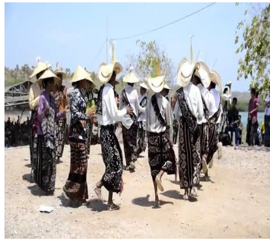
Figure 1. The function of ikat weaving as a traditional dance

Another function of ikat woven fabric is as a dowry or, in Rote custom, as a belis . In addition, it is also used as a betel cover. In Rote Ndao culture, ikat woven cloth is one of the items mothers bring to their children when their children migrate or are about to marry. Men will highly value women who have expertise in weaving.