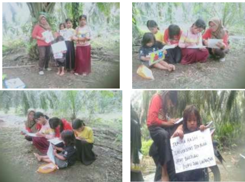
Figure 2. Learning Activities to Reading, Writing and Drawing